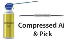
Compressed Air & Pick