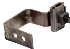
29-19943 Tap Bracket