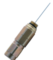
PP500P3 2 Piece Pin 500P3 Connector

This product may be protected by one or more patents. For further information, please visit: www.ppc-online.com/patents