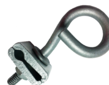
27-00185 "Q" Span Clamp