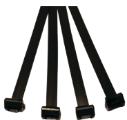
DT-D-13-50 13" Cable Strap w/ Locking Head