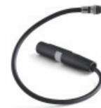
Available in AK Assembly