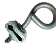
27-00185 “Q” Span Clamp