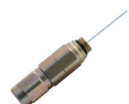
PP500P3 2 Piece Pin 500P3 Connector

This product may be protected by one or more patents • For further information, please visit: www.ppc-online.com/patents