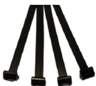
DT-D-13-50 13” Cable Strap with Locking Head