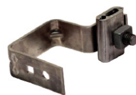
29-19943 Tap Bracket