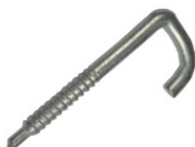
40-43007 Drive Hook