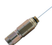
PP500P3 2 Piece Pin 500P3 Connector

This product may be protected by one or more patents • For further information, please visit: www.ppc-online.com/patents