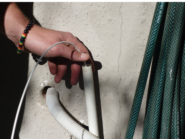
Miniflex® fiber cable’s groove technology makes it quick and easy to push through the microduct of a FTTH installation