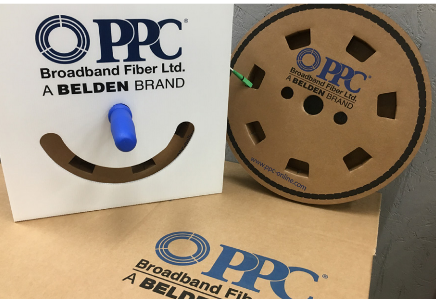
Pushable pre-terminated Miniflex® fiber cable