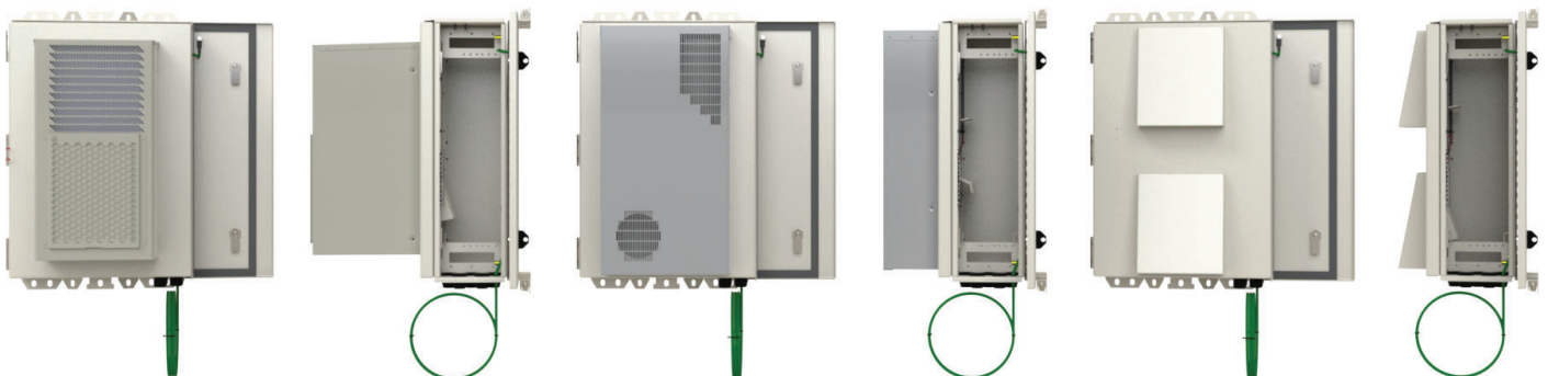
Harmony Edge w/ Fan System

This product may be protected by one or more patents • For further information, please visit: www.ppc-online.com/patents